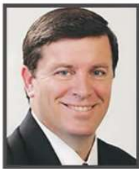
Senator Bryan W. Simonaire

Lowe House Office Building 6 Bladen Street | Room 180 | Annapolis