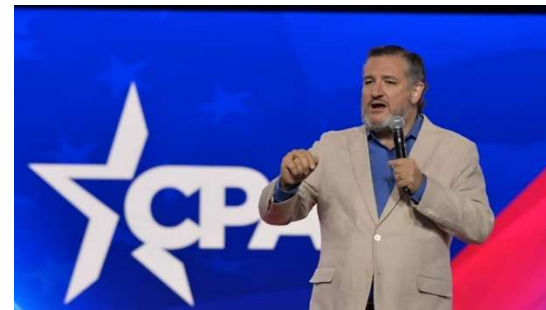
Ted Cruz to Speak at CPAC in DC 2025