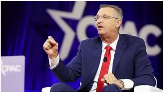
Doug Collins to Speak at CPAC in DC 2025