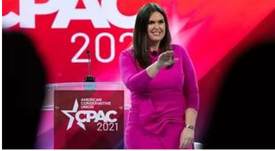
Gov. Sarah Huckabee Sanders to Speak at CPAC in DC 2025

https://www.cpac.org/blog/categories/events