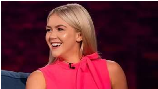
Karoline Leavitt to Speak at CPAC in DC 2025