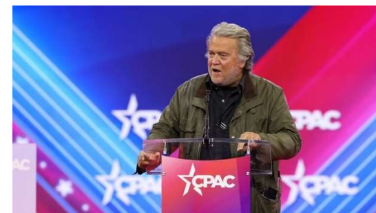
Steve Bannon to Speak at CPAC in DC 2025