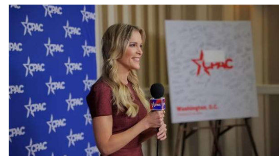
Megyn Kelly to Speak at CPAC in DC 2025